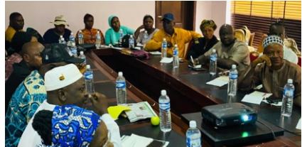
GIZ Digital Literacy Ogun