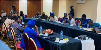
GIZ Digital Literacy Lagos