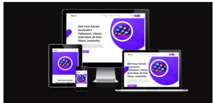
Social Media Marketing Panel