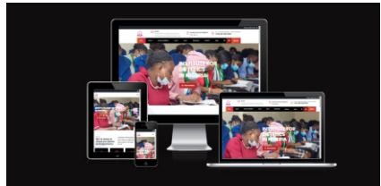
Institute for Dietetics in Nigeria